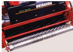
Grooming Roller (standard)