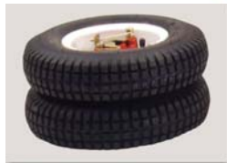
Wheel For Transportation