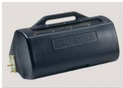
Grass Collector (standard)