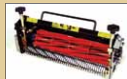
10 bladed cutting cylinder + groomer