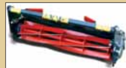
6 bladed cutting cylinder