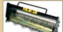
non-powered sorrel roller

NB: 8 bladed cutting cylinder for C-34 not shown