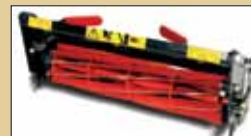
10 bladed cutting cylinder